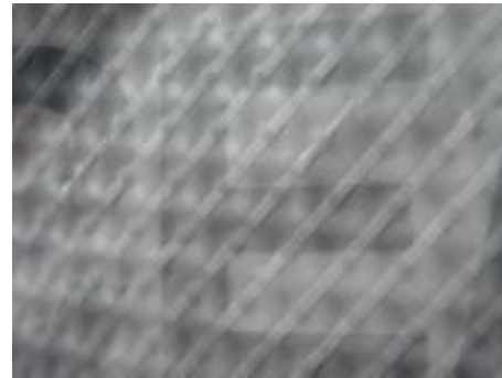
Profile of TAI-PORUX™ HOUSEWRAP