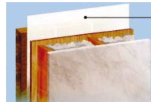
TAI-PORUX™ HOUSEWRAP in building structure